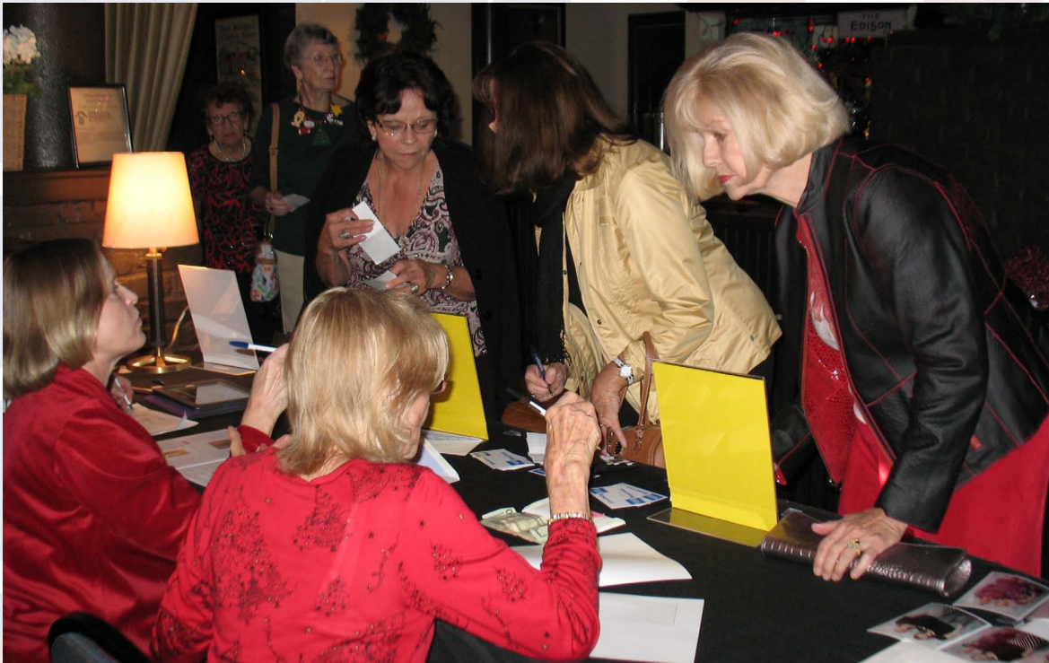
Above, the ladies line-up to register and pay for their meals! The turn-out was great!